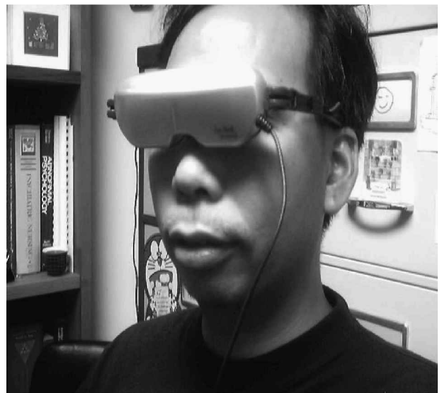
FIG. 2. Wearing the eyeglass display.

Patients were randomly assigned to participate in either a V session or a B session first while having their wound dressing and debridement for the leg ulcers. In V session, patients were instructed to wear a soundless video display eyeglass, of which the visual content was selected according to the preferences of the patients (ranging from Chinese opera to cartoons and natural environment of mountains and waterfall). In B session, patients watched a static blank screen via the eyeglass. The study was conducted over 2 separate days. Patients allocated to V session on the first day would be allocated to B session on the second day and vice versa. As a usual practice, no other analgesics were administered during these sessions.