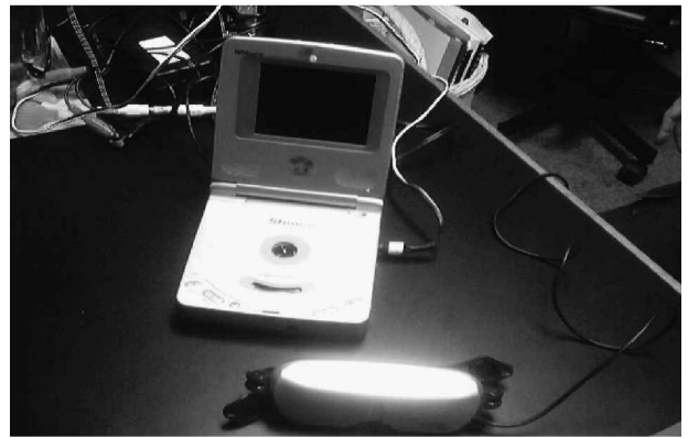
FIG. 1. The Olympic Eyetreck eyeglass was connected to a VCD.

In this study, an Olympic Eyetreck eyeglass was used and was connected to a VCD (Fig. 1). The eyeglass only weighs 120 g and could easily slip onto the user's face as a pair of spectacles (Fig. 2). Wear-