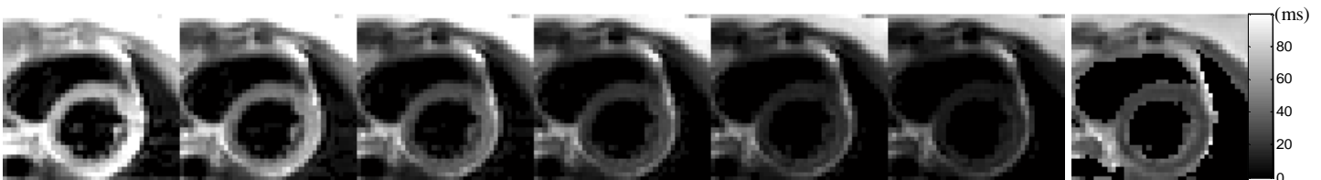
Fig. 1 3T MESE images with TE=5, 15, 25, 35, 45 and 55 ms obtained with the single-breathhold sequence, together with the computed T2 map.

Acknowledgements: GRF7794/07M, NIH R01DK066251/R01DK069373/R37DK049108, AHA0730143N and Children Thalassaemia Foundation.