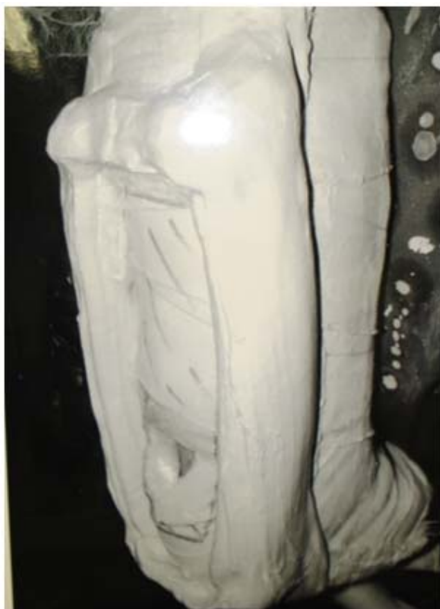
Figure 1 POP boot. A 'modified plaster of paris boot' is designed to make sure that there is no pressure on the flap pedicle even if the patient is lying supine in bed. One can appreciate the built in walls of the boot on the posterior aspect, with the flap visible from within them.