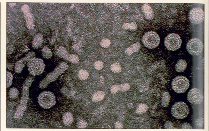
Hepatis B virus

used extensively in the past, especially for the right hepatic resection, a bilateral subcostal incision, with or without a sternal extension, has been used since 1992 irrespective of the lateralization of lesion.