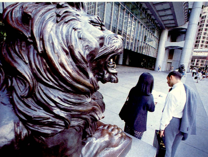
Guarantors need independent legal advice