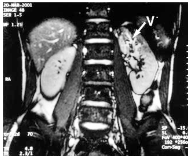
* V vasculature

The nutcracker phenomenon was first described by de Schepper 1 in 1972. Compression of the left renal vein between the superior mesenteric artery and the aorta causes left renal vein hypertension, 1 and this led to a left varicocele in this patient. The resulting renal vein hypertension is also a cause of haematuria, thought to be due to hypertension-induced anomalous calyceal-venous communications. 2 The pathophysiology of this condition is not fully understood, but it may be more prevalent in thin people with a decreased amount of perirenal and pararenal adipose tissue or in those with a prominent lumbar lordotic curve that causes forward displacement of the aorta. 3 Abnormal branching of the superior mesenteric artery from the aorta has also been attributed to be the underlying pathology. 4,5 Apart from MRI or computed tomography, selective left renal vein phlebography and renal vein pressure measurement are helpful for establishing the diagnosis. 4,5 For asymptomatic patients