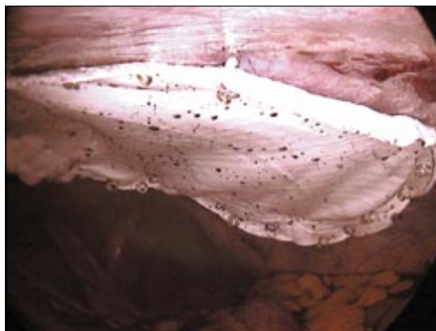
Fig 2. Completed repair with the GORE-TEX DualMesh being anchored in place by transabdominal sutures and spiral tackers

The technique for repair of incisional hernia has evolved in the 20th century. Primary closure of