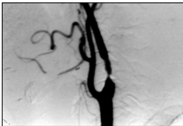
Fig 2. Carotid arteriogram showing a significant stenotic lesion of the internal carotid artery

were achieved in all patients prior to the operation. Aspirin 150 mg/d was prescribed for all patients.