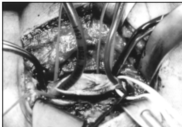
Fig 3. Intra-operative photograph showing the carotid arteriotomy with a Javid inlay shunt in situ after endarterectomy

The mean age of the study population was 70 years (range, 58-86 years) and the male to female ratio was 6:1. The patients had a history of one or more of the following medical diseases: hypertension (n=24), ischaemic heart disease (n=17), diabetes mellitus (n=12), and hyperlipidaemia (n=7). Of the 35 patients, 29 (83%) were currently or formerly chronic smokers, 17 (49%) had a history of stroke, and 19 (54%) had experienced