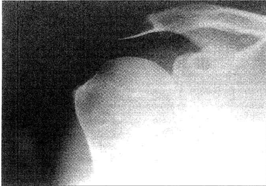
Figure 1: Anteroposterior radiograph of the right shoulder

A 44-year-old man presented with a painful right shoulder, worse on movement of the shoulder joint. An anteroposterior radiograph was taken. (Figure 1).