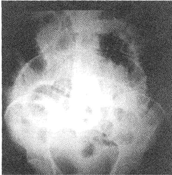
Figure 1: Supine abdominal radiograph

A young man presented with sudden onset of abdominal pain. An abdominal radiograph was performed (Figure 1).