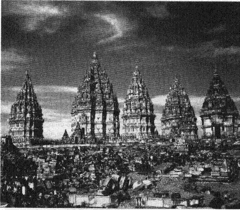
Prambanan Central Java, Indonesia Huge Hindu temple complex, 9th century AD. Original over 200 temples on the site

complete discontinuity in the Cambodian tradition of temple reconstruction and maintenance.