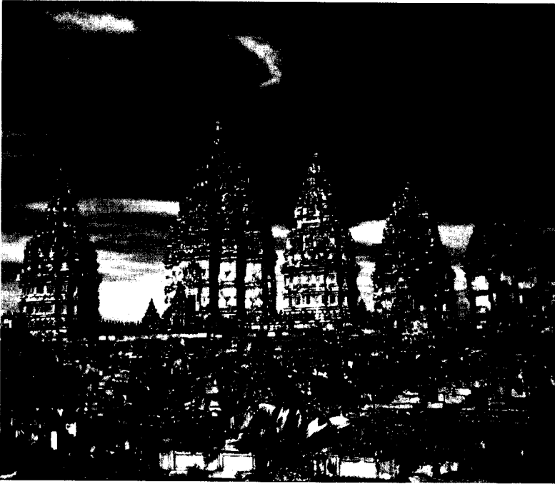
Prambanan Central Java, Indonesia Huge Hindu temple complex, 9th century AD. Original over 200 temples on the site

complete discontinuity in the Cambodian tradition of temple reconstruction and maintenance.