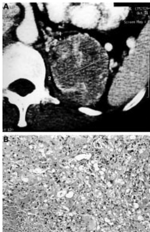
Figure 3 (A) Computerised tomography scan of an adrenal angiomyolipoma (case 18) showing an adrenal mass of heterogenous contrast enhancement. (B) Photomicrograph of the same adrenal angiomyolipoma showing the predominant epithelioid cells component. Haematoxylin and eosin stained; original magnification, \times 200 .

were detected on imaging. They accounted for 1.3% of the surgically resected primary and 0.7% of all primary adrenal tumours. The tumours were composed of mature tissues arising from more than one germinal layer. All tumours contained a large fatty component as well as calcification/bone. Surgery was carried out because of the sizes of the tumours (diameters, 7.5 cm, 10 cm, and 11 cm, respectively). No immature elements or malignancy was noted in the tumours. The patients were free of disease at one, seven, and eight years after surgery.