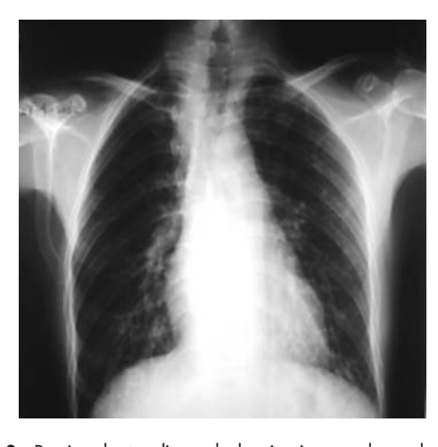
Figure 2 Routine chest radiograph showing increased vascular markings in the lower lung zones.

Our patient presented with an interesting array of events, which could ultimately be interpreted as the complications of PAVMs and immunoglobulin deficiencies. The occurrence of multiple brain abscesses, caused by oral flora, suggests that paradoxical embolisms could have occurred as the underlying key mechanism for the development of septic embolism, presumably aggravated by underlying immunoglobulin deficiencies. Paradoxical embolism is a well known complication of PAVMs. Other features of PAVMs include hypoxaemia, dyspnoea, clubbing, cyanosis, polycythaemia, haemoptysis, cerebral infarction, high output cardiac failure, and abnormal chest radiology. The cause of hypoxaemia in patients with PAVMs is due to persistent shunting of deoxygenated blood to the systemic circulation with a similar mechanism to cyanotic congenital heart diseases, except that this shunt is