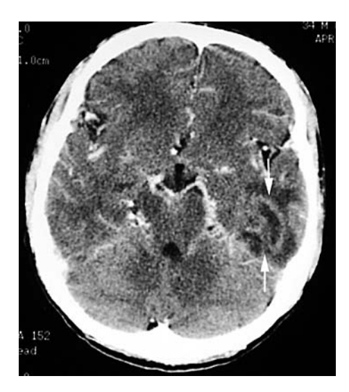
Figure 1 Contrast enhanced computed tomogram of the brain showing a hypodense nodule with rim enhancement and marked surrounding vasogenic oedema consistent with brain abscess in the left temporal labe

embolisation procedures, this patient has remained asymptomatic neurologically, and has a stable oxygen saturation of 96%–98% (when breathing room air). The patient is undergoing regular intravenous immunoglobulin replacement under the care of an immunologist.