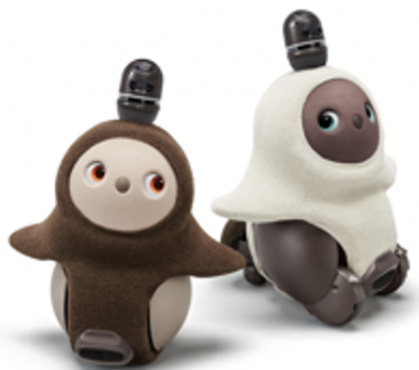
Figure 1. LOVOT, the social robot.

The popularity of social robots has attracted much attention from care providers, especially during the recent COVID-19 pandemic. According to Hegel et al [26], social robots are specifically designed to facilitate human-robot interaction. With recent advances in machine learning applications and robotics, several companies are developing advanced consumer robots with smart sensorimotor systems [34]. Although PARO has been widely used in dementia care research and has received many positive reviews, the robot seal lacks social and auditory capabilities [35]. In contrast, a new mobile social robot called LOVOT (Love+Robot) launched in 2018, invented in Japan, was designed to provide humans with love or the perception of love [36]. LOVOT was designed as a home robot, also known as a companion robot or a social robot, and is equipped with AI and advanced sensor features. As such, LOVOT evolves over time based on its interactions with its user, thanks to its machine learning technology (eg, deep learning), which allows it to develop a unique personality and perform intelligent movements in real time [37]. As LOVOT is relatively new to the field of social robots, it has yet to be tested among single older adults in Singapore. Therefore, our research fills this gap in the literature. Figure 1 shows a photo of LOVOT in our study.