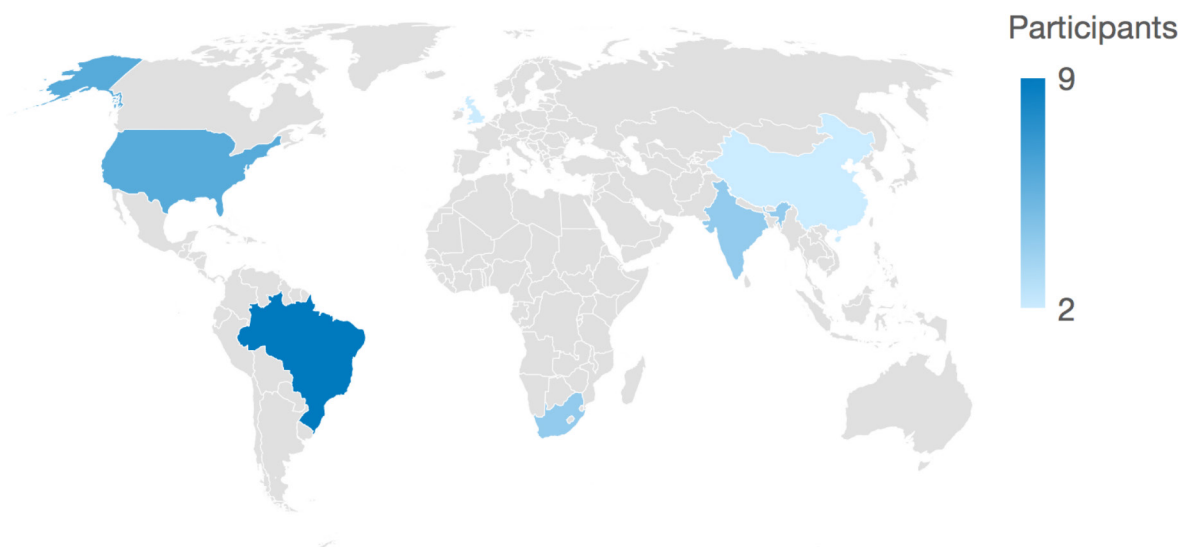
Figure 2 Geographical distribution of the 27 participants of the final round per country.

Postoperative stiffness is a common sequela after KD which has been associated with early surgery. 18 Therefore, delaying, or staging, surgery can potentially reduce stiffness, but patient selection for delayed or non-operative management can be challenging, which was also a point established in our study. One of