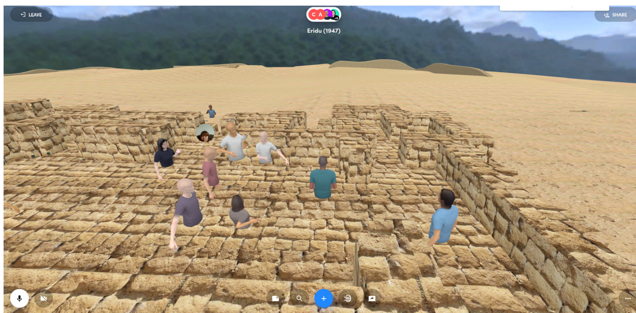
Figure 3. A virtual reality group tour of an ancient site in Spatial.io.

aware computer graphics simultaneously. Third, we lack theoretical foundations for predicting and verifying successful teaching with XR in the archaeological classroom. For example, Parong and Mayer (2021) unexpectedly found that students were more engaged in history learning through the lower immersive environment of a video slideshow rather than in a highly interactive VR environment. By conducting additional, similar experiments and interpreting them within a clear educational theory context, we believe that XR holds great potential for learning. Therefore, in this article, we attempt to address this third point by laying the groundwork for the theoretical framing of XR deployment in the archaeological classroom.