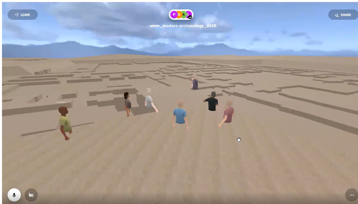
Figure 6. Virtual group tour in Spatial.io.