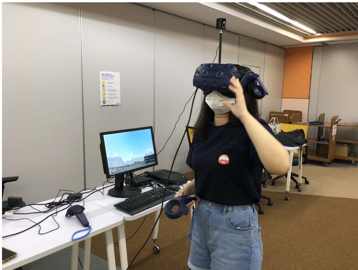
Figure 2. Student experiencing virtual reality as part of a university class.

Archaeologists have long recognized the potential of XR for many purposes, including teaching (Vlahakis et al. 2001). Yet, the useful, large-scale, sustained application of these technologies in the classroom remains scarce. We see three obstacles to achieving this goal. First are the resource constraints—not only has the equipment itself been costly, but the skills and time required for both creating 3D content and setting up meaningful digital functionality are prohibitive. Elmqaddem (2019) presents an optimistic view that recent advances can now better enable XR deployment for education. Second, VR applications in education have often been solo experiences that lack social interactions with teachers and other students, even though learning is often recognized as a social activity. When combined with the first obstacle, we recognize that XR has been difficult to scale up to a classroom context that can involve a group of students. Yet technological progress now enables a teacher and multiple students to interact in virtual worlds together, using avatars in VR (Cobb and Nieminen 2023). More interestingly, we see the potential for MR to facilitate collaborative learning since everyone would be able to see each other and the spatially