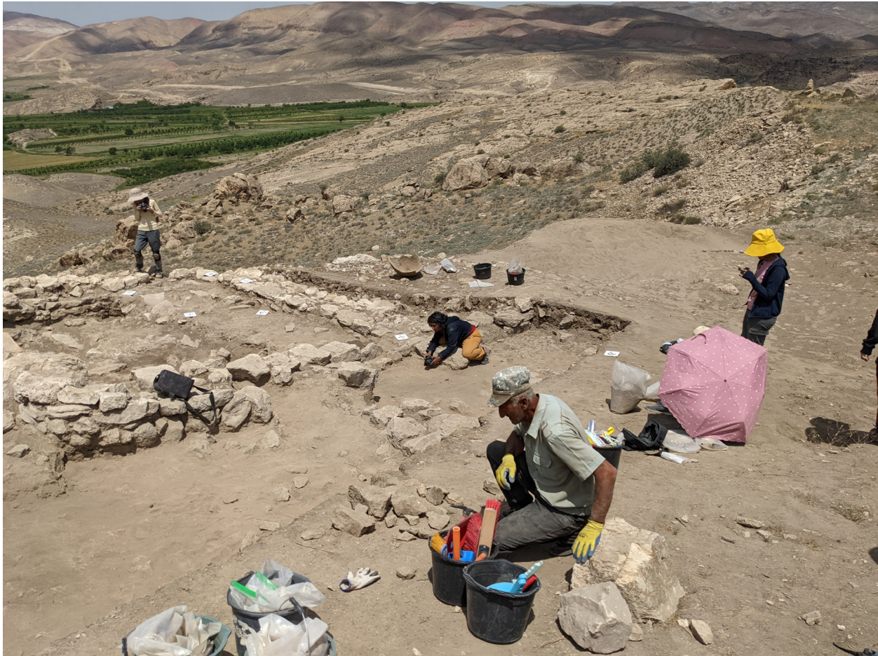
Figure 1. Excavating and recording data at a field project in Armenia.

Furthermore, archaeology utilizes a wide variety of data types that may have their own spatial or visual qualities, such as satellite imagery, 3D models, and maps/geographic information systems (GIS).