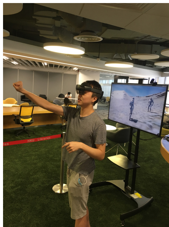
Figure 5. Student using the Microsoft HoloLens 2 MR headset to visit an archaeological site.

Thus, a wide range of educational theories and ideas can guide and serve as foundations for our deployment of XR in archaeological pedagogy. We see great potential for XR to improve visual and spatial learning in the classroom through embodied interaction with archaeological information that makes learning more experiential and engaging. We hope that the affordable headsets that are increasingly coming onto the market can make XR learning more accessible, particularly since our efforts should be guided by inclusive teaching practices (Heath-Stout and Hannigan 2020; Quave et al. 2020). We see some interesting potential directions to take the research into XR for learning archaeology in the classroom based on some research gaps that we have identified in the educational literature. Williams (2011) highlights the importance of collaborative learning and group work, but this type of research should also be expanded to examine how instructors and multiple students can learn together in XR (Cobb and Nieminen 2023). We also identify the use of MR for learning as a particularly important research gap. MR can help support group learning because students would see the real world and each other at the same time they are interacting with a full