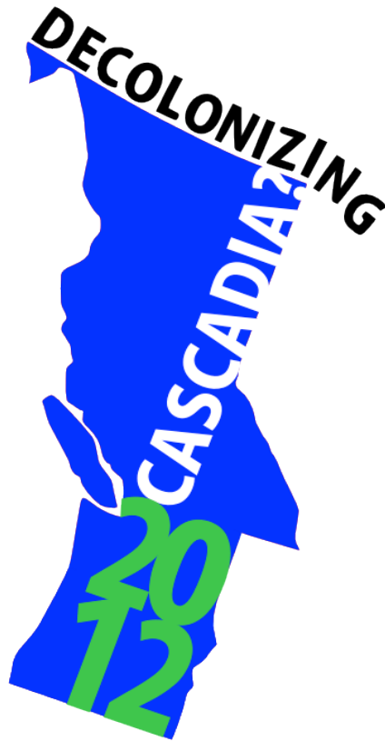
Figure 1: Decolonizing Cascadia? Rethinking Critical Geographies 7th Annual Regional Conference Logo. Creative Commons Attribution-ShareAlike 3.0 Unported (CC BY-SA 3.0) License. Original Cascadia map by Cascadianow (2012).

decolonizing efforts. The color scheme plays off the use of blue, green, and white in the unofficial flag of the Cascadia independence movement – the Doug Flag – by appropriating them for a different cause. By designing several logos and choosing a final design within the organizing committee, we were forced to make a difficult compromise between political goals and the realities of producing a legible logo. While some students involved in the design had experience in the visual arts, the process was a valuable practical learning experience in the process of non-hierarchical decision-making and compromise.