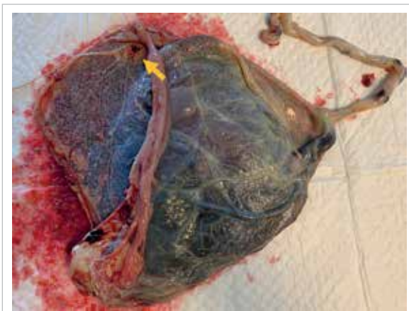
FIG 2. Photograph of placenta showing an area of cauterisation (arrow) next to cord insertion of miscarried twin

(TTTS) and selective intrauterine growth restriction but may also occur unexpectedly in pregnancies with no obvious complications. 1 Feto-fetal haemorrhage