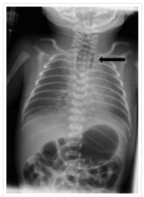
FIG I. A I.5-kg baby girl delivered at 35 weeks gestation. Plain radiograph taken at birth showing the orogastric tube (arrow) coiled at the proximal oesophageal pouch with distal bowel gas

After surgery, the patient was managed in the neonatal intensive care unit according to our usual protocol. On day 1 after surgery she developed sudden profound desaturation with CO_2 retention when the endotracheal tube was secured at 8 cm