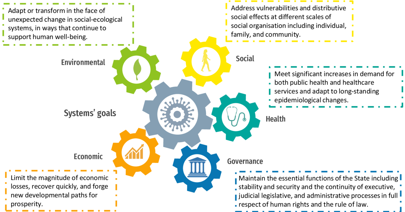
Figure 1 Interconnected societal systems and their different goals in addressing the COVID-19 pandemic.

governance functions and minimising any undesirable systemic effects. This definition encompasses the capacities of societies to (1) prepare, prevent and protect before disruption; (2) mitigate, absorb and adapt during disruptions; and (3) restore, recover and transform after disruption. 6