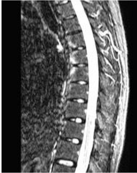
Figure 1. Corner inflammatory lesions.

3500/80 ms, inversion delay being 140–160 ms; matrix size, 248 \times 200 . Twenty-four slices were obtained and the total scan time was 5 min 7 s.