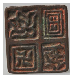
Fig. 9 Bronze seal with loop on the back, in four-square composition inscribed one lotus motif, one swastika, and two unidentifiable characters, bronze, Ordos Region, China. Collection of the University Museum and Art Gallery, Hong Kong.

The inscriptions on these pieces are quite consistent with the well-studied pieces of Yuanya. For instance, there is the most common pattern of a family name decorated with a pictorial sign, indicating a private use of "Ya"—the private signature. Another popular pattern consists of two or four characters in