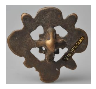
Fig. 12 Cross shape piece with loop on the back which sticking out of the hollowed area, Ordos Region, China. Collection of the University Museum and Art Gallery, Hong Kong.

Mostaert's witness, which will be mentioned later in this article. But this hypothesis still cannot give a satisfactory answer to the redundancy of the worked-out design, since the deeply-curved one has already facilitated the printing on hard mediums such as mud. And not only so, the distinctive reprocessing traces, especially with those worked-out pieces, on the surface of the backboard where the loop/loops were attached, and in some cases, the lack of harmony caused by the sullied worked-out design where the attached loop/loops stick out of the purposed hole (fig. 12), drives us to query the originality of the loop/loops, or of the worked-out design. Therefore, before more evidence is interrogated, we should not jump so readily from the hypothesis of the medium to an overall interpretation.