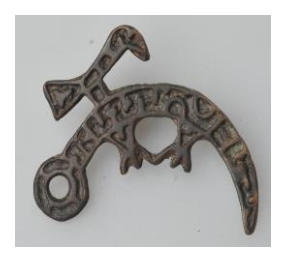
Fig. 5 Paired-bird motif decorated object with one bird missing, bronze, Ordos region, China. Collection of the University Museum and Art Gallery, Hong Kong.