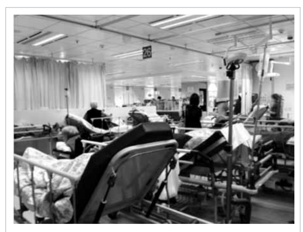
FIG 1. Emergency department overcrowding from access block in Hong Kong

Overcrowding and access block in EDs are rapidly becoming problematic areas for the health system even in Hong Kong. Figure 1 shows a photograph depicting the crowded ED with literally dozens of patients waiting for admission, which is almost an everyday scenario in a major teaching hospital in Hong Kong. At the time of drafting of this manuscript, the hospital management had set a target that patients waiting for admission should not have to wait longer than 24 hours (Fig 2), a target that is ludicrous by international standards. This review therefore aimed to answer the question: what are evidence-based strategies and solutions that can be applied within the ED and the hospital setting that are