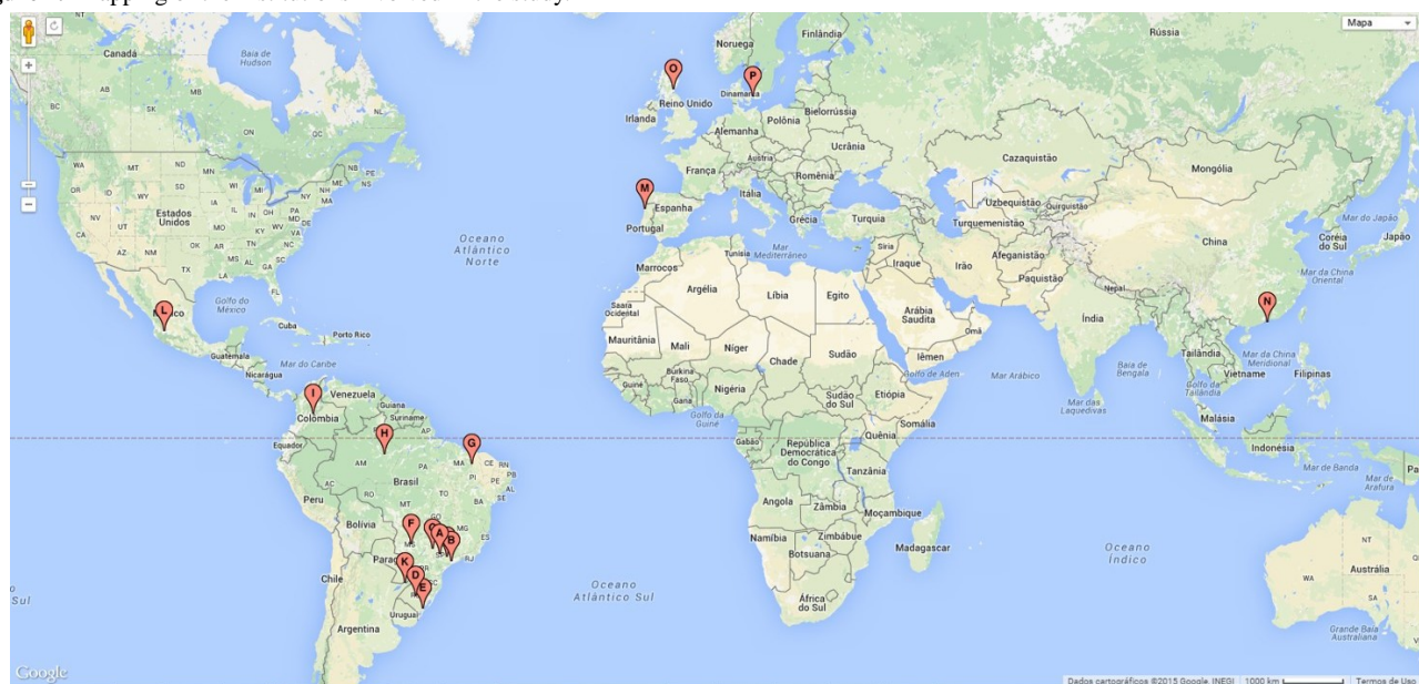
Figure 1. Mapping of the institutions involved in the study.