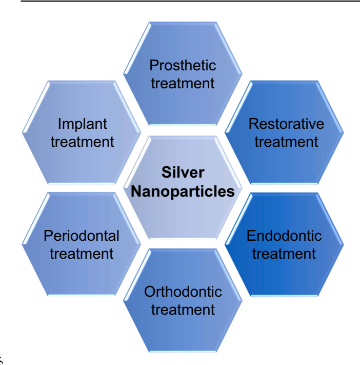
Figure 2 The antibacterial application of silver nanoparticles in dentistry.

silver nanoparticles has also displayed antifungal properties against the adhesion of Candida albicans , which is one of the key opportunistic pathogens on a denture base.<sup>22</sup>