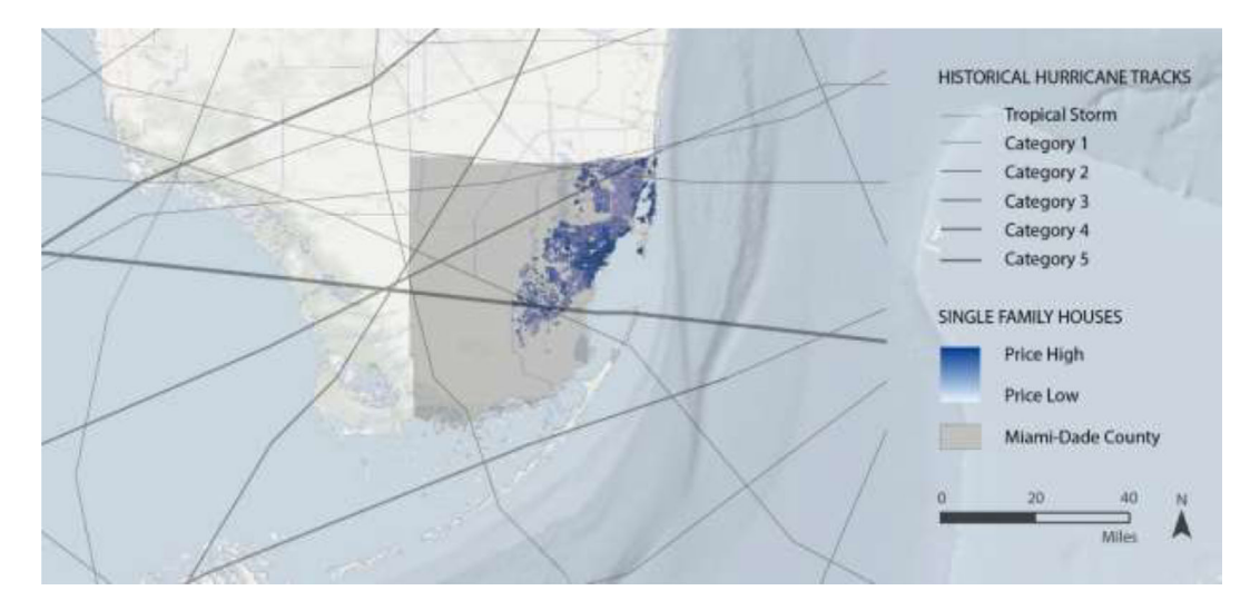
FIGURE 1 Site map. Illustration by author