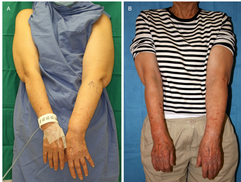
Figure 4. The same patient as in Figure 1: (A) clinical photo before liposuction; and (B) clinical photo 40 months after liposuction. The limb size was maintained with only regular use of Class I compression sleeve. When liposuction is performed in the right patients, i.e., patients with fatty phase of lymphedema, only low maintenance is required for the control of limb size