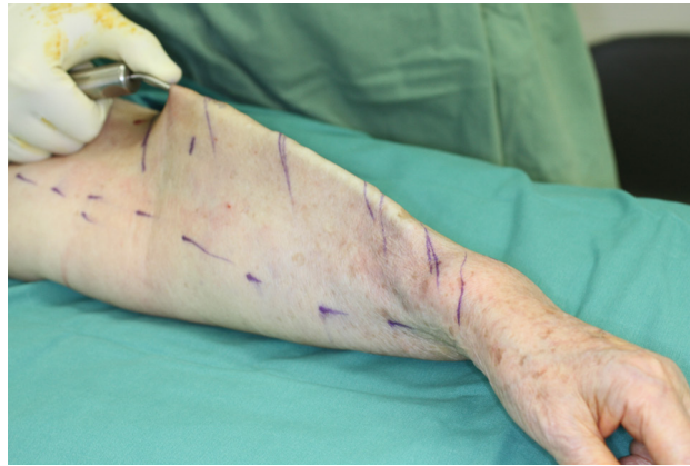
Figure 3. The same patient as in Figure 1: suction-assisted liposuction was performed until the overlying skin could be lifted with ease