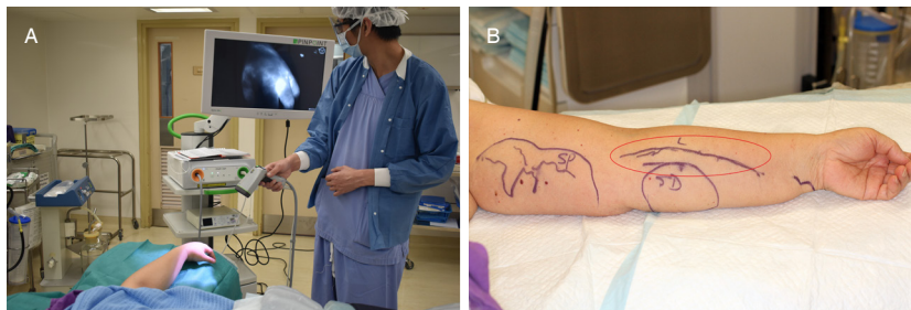
Figure 2. A: Indocyanine green-lymphangiography was performed before liposuction; B: The indocyanine green lymphangiography findings were marked on the skin. This patient had a linear pattern at the volar aspect of forearm. Liposuction was not performed in a 2-cm region around the linear pattern (red circle)