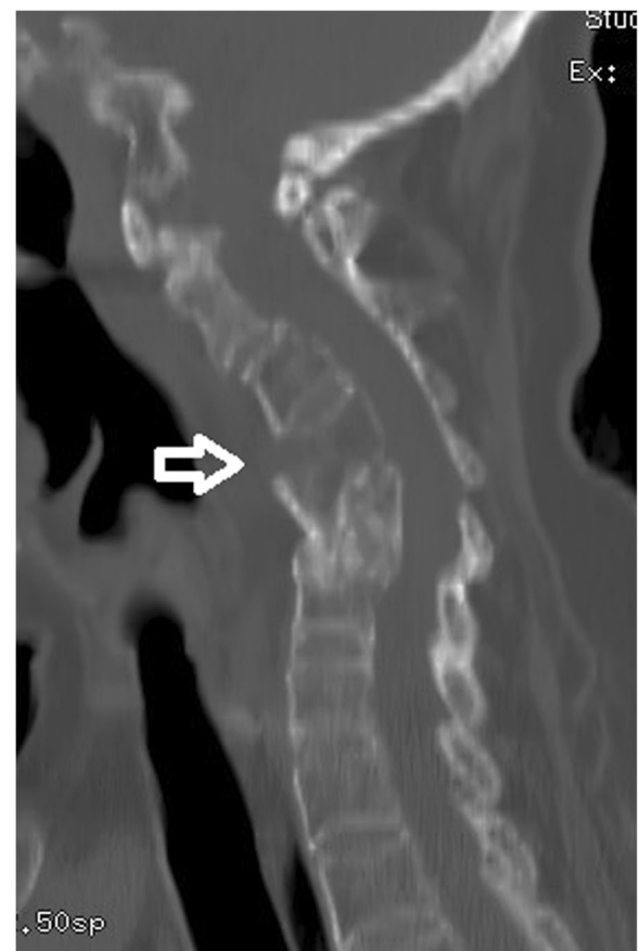
Fig. 2 Sagittal CT scan after fracture with the white arrow pointing at the fracture line

no neurological compromise but the neck posture markedly improved. A reduction in kyphotic deformity was observed with good horizontal gaze. The kyphotic angle was measured to be 11^\circ from C2-C6. No further traction was applied and she then underwent a combined anterior and posterior in-situ fusion without any osteotomies due to the satisfactory cervical