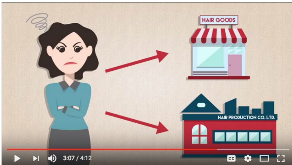
Screenshot 2: Animated case description: Susan contemplates legal action.

The videos in the series also make use of multiple modes to convey language-focused teaching points. For example, in Episode 2, “Organizing the structure”, students are presented with a full paragraph of text, with important functional lexical phrases (Nattinger & DeCarrico, 1992) highlighted in bold type to facilitate “noticing” by learners. As an example, the phrase “the next question is whether” frequently functions to introduce an issue and so is presented in bold type (Screenshot 3).