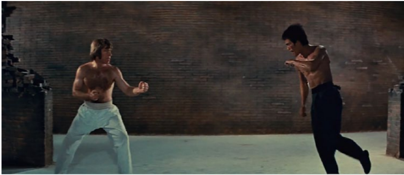
Figure 5. In The Way of the Dragon , Tang Lung moves swiftly around Colt while evading his attacks. Tang's movement is characteristic of Lee's semi-circular pattern, manifesting the intimate connection between circularity and Daoist tranquility.

Continuing from Fist of Fury , made with Lo Wei, to The Way of the Dragon , Lee's first directorial effort, Lee's Daoist rendition of martial ideation is best exemplified in what was to be his follow-up to The Way of the Dragon , the unfinished film The Game of Death , in which he sought to make a more detailed connection between cinematic kung fu and his martial arts philosophy through extended dialogue, intricate choreography, and sophisticated cinematography.