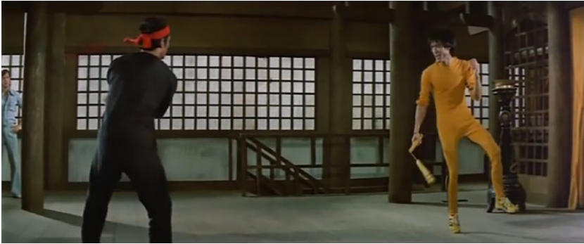
Figure 6. In The Game of Death , Lee demonstrates, for the first time, the martial ideational wu in full circle. Different from the previous instances that show only quarter- or semi-circles, Lee's character Hai Tien incorporates the concepts of reversal and return during his full-circle movement. Rather than passively evading attacks, he actively uses deception and interception to signify the arbitrariness of the Daoist tranquility.