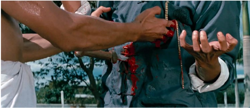
Figure 2. The Big Boss highlights emotional expressivity through explicit violence and exaggerated martial arts performance. Cheng Chao-an (Bruce Lee) thrusts his fingers into Hsiao Mi's (Han Yingjie) rib cage in the final battle.

of Death . Instead, it is the manifestation of reversal and return through his negotiations of circles of different sizes and shapes. Those are the critical moments where circularity signifies more than expressivity and sublimates into tranquility.