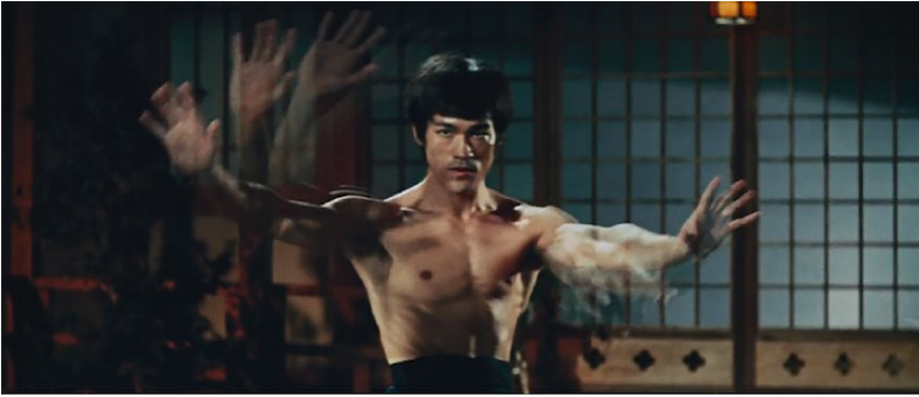
Figure 3. Chen's negotiation of circularity and tranquility through his hand movement enhanced by a motion trail effect in Fist of Fury . The movement signifies both the process of expressive amplification and a return to Daoist tranquility.

hands, which return to the original position after the two cycles as if nothing has changed. Chen's calmness is contrasted with Petrov's response. Stunned by Chen's awkward hand movements, Petrov shouts back in his classical karate stance. When Petrov realizes that Chen is not ruffled by his hysterical scream, he looks perplexed. Then the audience sees Chen's unruffled face as he keeps performing the first cycle of hand movement with a motion trail effect in slow motion.