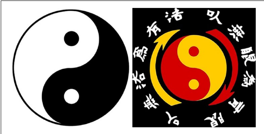
Figure 1. Daoist logo (left) and JKD logo (right).

Wu first expands into all things, hence da (大), or expansion. Then, in its circular motion, which is shi (逝), or passing away, things drift away, which is yuan (遠), or far away. Eventually, they are driven back to the original point, which is fan (反), or return (Chen, 1970/2017, p. 12).