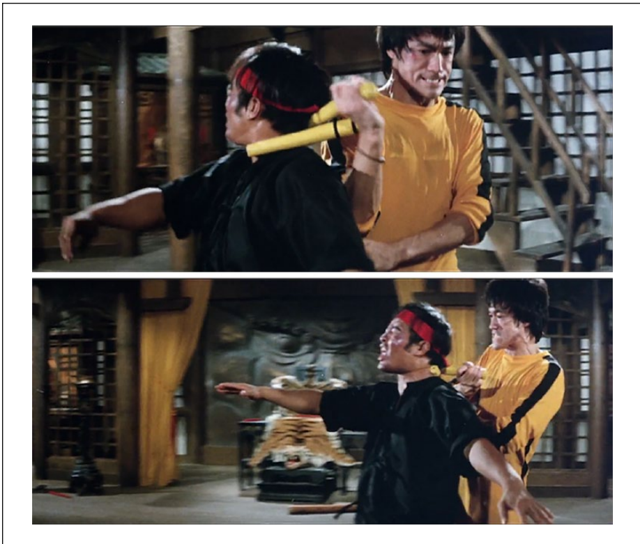
Figure 7. In The Game of Death , Hai Tien steps clockwise to Pasqual's back to choke him and the camera also moves clockwise to parallel the movement. In so doing, the background moves counterclockwise, forming a full circle between choreography and cinematography.