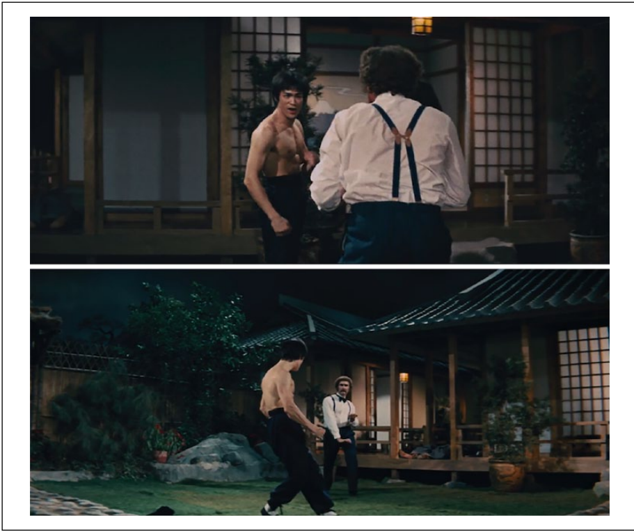
Figure 4. At the end of Chen’s fight with Petrov, the arbitrariness of Chen’s quarter-circle footwork (bottom) breaks the artificiality of full-circle movement in the beginning of the fight (top), revealing the nuanced connection between circularity, expressivity, and tranquility.

circle. It bears some resemblance to theatrical routines common in Chinese opera, in which the two parties move in stylized steps from one end of the stage to the other. The transition from the theatrical circle to the erratic circle signifies Lee’s fulfillment of martial ideation due to his representation of the Daoist tranquility, which is arbitrary and boundless (Figure 4, top and bottom). No longer performing rhythmic and highly stylized steps as at the beginning of the fight, Chen breaks his rhythm and forces Petrov to guess where he will move and what he will throw next. At the same time, Lee fulfills the Daoist idea of ziran in his movement, which is not forceful and highly fluid (Laozi, 2008, chap. 25). The predominance of irregular circles is stated in Lee’s writing. He defines JKD as “an undifferentiated center of a circle that has no circumference” (Lee, 1975/2015, p. 212). In other words, Lee does not efface the notion of circularity despite his preference for arbitrariness. The circular pattern, on one hand, is intimately connected to the Daoist wu , hence endowing the martial performance with a philosophical basis; on the other hand, Lee realizes the significance of expressivity in martial arts performance. The motif of circles is theatrically and cinematically expressive. His ingenuity lies in the fact that he strikes a balance between performativity and practicality.