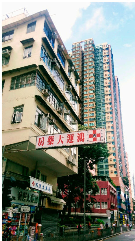
Figure 3. New development of single high-rise buildings in the community comprised of mostly “Long Lau”. Picture captured at San Po Kong, one of the socially deprived districts in Hong Kong.

the availability of green space was coincidentally lower in more socially vulnerable areas such as Sham Shui Po, Wong Tai Sin and Kwun Tong (1.9, 1.7 and 1.3 m 2 per each older adult, respectively), compared to 3.4 m 2 of green space per each older adult in Hong Kong [68]. Such a high percentage of socially deprived population in these old urban areas contributes to psychological distress, which in turn increases the risk of developing depression [69].