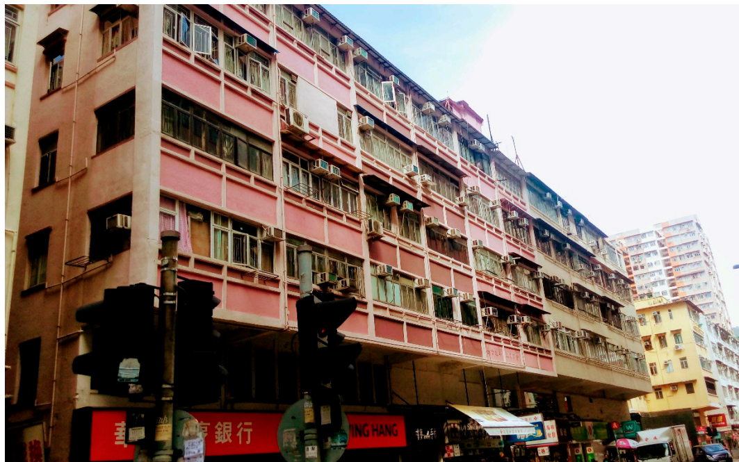
Figure 2. Representation of “Tong Lau”, historical buildings with poor quality and living conditions in Hong Kong. Picture captured in San Po Kong, one of the socially deprived districts in Hong Kong.

living conditions, in term of building services, social environment, and living quality [64]. Some flats in these buildings could be split into only 3 to 5 m 2 with extremely inadequate facilities. As such, it is expected that older adults living in these tiny flats would become socially isolated and suffer from depression.