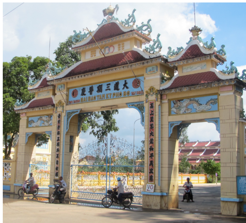
Picture 1: The entrance gate to the Cao Đài Holy See in Tây Ninh, Vietnam, with the Chinese inscription "The Third Cycle of Universal Salvation"