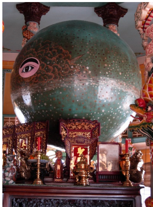
Picture 4 – The main altar inside the Holy See of Tây Ninh: the ubiquitous Eye of Master Cao Đài – aka the Jade Emperor – painted on a Celestial Globe