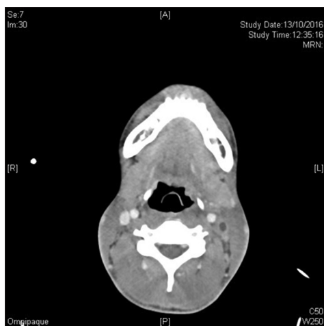
Figure 1: Thrombosis of left internal jugular vein and its branches on contrast computed tomography