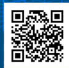
What did people say about SCIs ?