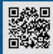
Number of SCIs