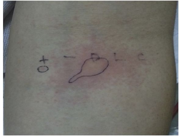
17I72185 Skin Test read at 20 min

A 42-year-old generally healthy man was referred for assessment of recurrent anaphylaxis after taking several medications to alleviate symptoms due to upper respiratory viral illnesses. Over the course of many years, he experienced several episodes of generalized, pruritic, urticarial eruption after using these medications. He became more concerned when, 3 years before his visit to our allergy clinic, he suffered a severe reaction that included diffuse urticaria, flushing, and angioedema, coupled with shortness of breath and dizziness within 5 minutes after the application of the over-the-counter intranasal drops, Coldistan. His anaphylactic response was so intense that he was transferred to the intensive care unit and required an adrenaline infusion. Review of the packaging label of Coldistan revealed that the active ingredients consisted of diphenhydramine and naphazoline with no excipients listed. Serum tryptase during the event was