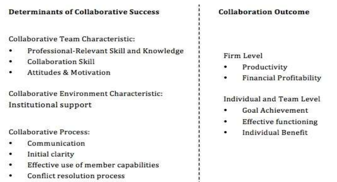
Figure 1. Collaboration Determinants and Outcomes by (Amabile et al., 2001)

organization is dynamic, some individuals may leave project before completion, but the impacts of their activities before may affect to the outcome of final project. We borrow definition of collaboration from Jassawalla and Sashittal, they describe it as “the coming together of diverse interests and people to achieve a common purpose via interactions, information sharing, and coordination of activities” (Jassawalla and Sashittal 1998:239). Amabile et al. (2001) claim that there is little research about cross-profession collaboration. They build up a cross-profession collaboration theory and claim three determinants of successful collaboration: Collaborative Team Characteristics, collaboration environment characteristics, and collaboration processes (See Figure 1). Each determinant contains sub-categorized factors that influence its extent. We borrow their concepts and principles to construction industry. Hence, we discuss the characteristics of BIM implementation in construction and explain how these factors influence the success of a BIM enabled project.