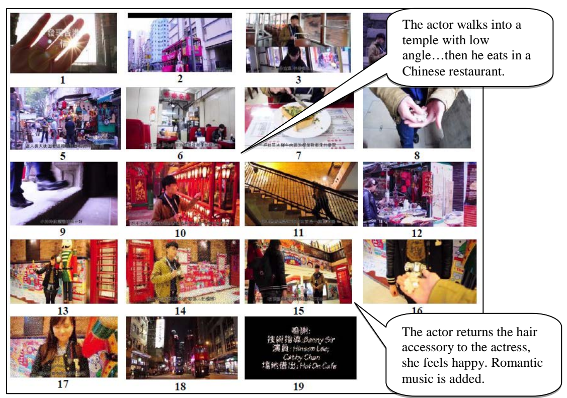
Figure 2 . Frames extracted from Cindy's digital story.

Participant Two: Rita (no skills of video production)