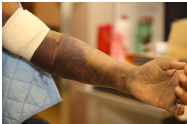
Figure 2: Hematoma of left anterior cubital fossa, after blood taking.

In view of the rarity of a rebleed on postoperative day 5 in the context of stable wounds, the patient was asked about history of bleeding tendencies. The patient revealed that he suffered from a spontaneous lip hematoma 6 months prior to this admission, and had been experiencing significant bruising after routine blood tests over the same time period. Blood tests for complete blood count and clotting were taken. Immediately after venesection, the patient developed continuous oozing from the puncture site, which required prolonged pressure compression, and ultimately resulted in extensive swelling over the left anterior cubital fossa (Figure 2).