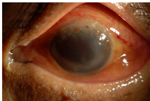
Figure 3: Postoperative day 12-Chemosis resolved.

His chemosis resolved quickly after commencement of oral steroids and NovoSeven (Figure 3), and the IOP gradually returned to normal. At 16 days postoperation, the patient was noted to develop early band keratopathy. At postoperation day 12, the visual acuity was reduced to no light perception (NLP). In view of poor visual prognosis and significant bleeding risk, surgical drainage was not recommended.