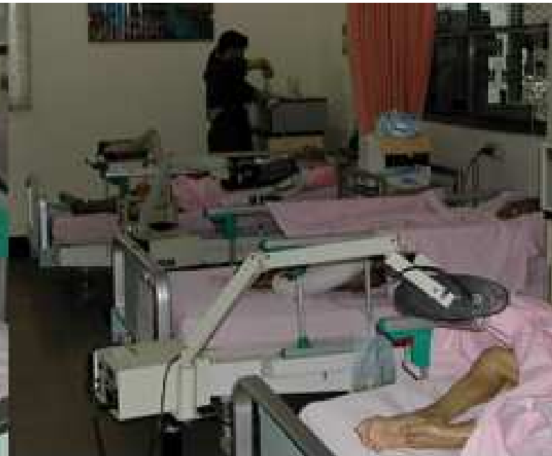
Bed sore 2