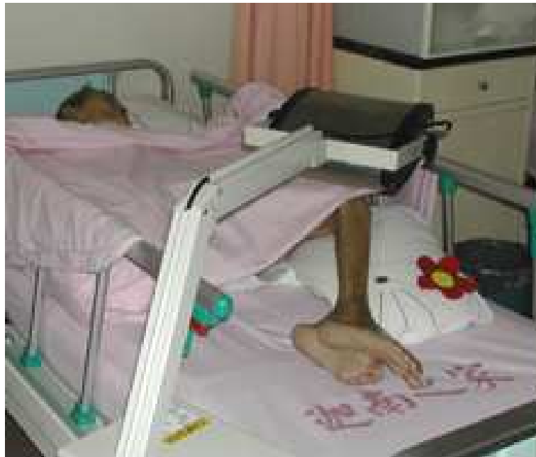
Bed sore 1