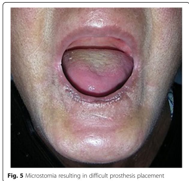
Fig. 5 Microstomia resulting in difficult prosthesis placement

Our second case fulfils the major criteria of symmetrical thickening of the skin proximal to the metacarpophalangeal joint, as shown in Fig. 6. Our patient also exhibited Raynaud's phenomenon, along with other cardinal features, which are the most common and earliest manifestations of the disease in 95 % of cases, as suggested by Lester et al. [14] and other authors [6]. Localized scleroderma/morphea is more common in white women with a female to male ratio of 2 to 4:1 and an incidence rate of 0.3 to 3 cases per 100,000 individuals/year.