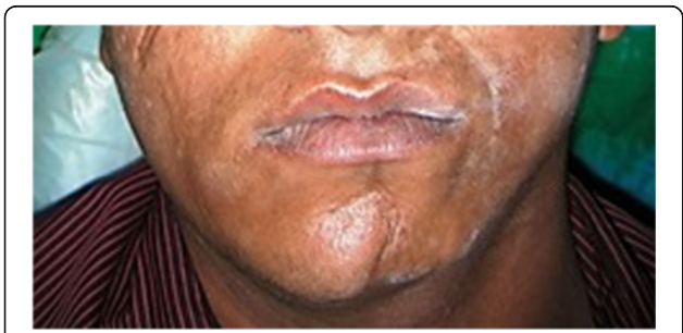
Fig. 2 Gross asymmetry of face (left side) with "en coup de sabre" on chin

Fundoscopic examination of his eyes and audiometry showed no abnormalities. Ultrasonography examinations of his bilateral buccal mucosa and parotid glands were normal. A skin biopsy revealed a thickened epidermis with sparse adnexal structures. Thickened and closely packed collagen bundles in reticular dermis, along with hypocellularity and sparse lymphoplasmacytic infiltrate in the dermis, were suggestive of morphea.