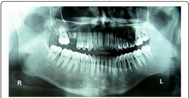
Fig. 4 Panoramic view showing gross asymmetry of face (left side) with relative microdontia and thinning of ramus/body of mandible

A 53-year-old woman of Dravidian origin visited our department complaining of difficulty in using her complete dentures as a result of the gradual reduction in mouth opening over the previous 7 years. She also complained of a burning sensation of her oral mucosa (predominantly in her palate) and a tightness of the skin in her perioral and neck regions. On clinical examination