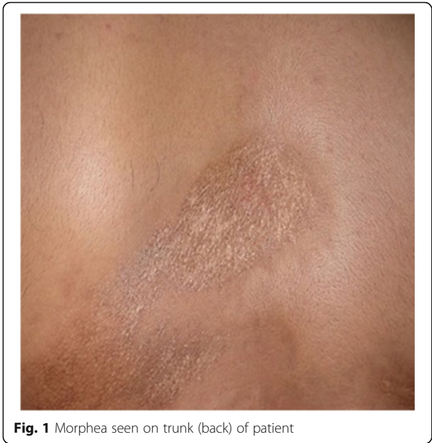
Fig. 1 Morphea seen on trunk (back) of patient

Hence, our provisional diagnosis was facial hemiatrophy with plaque morphea and further investigation was recommended.