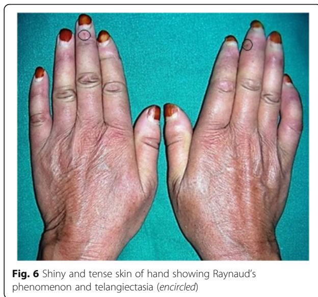
Fig. 6 Shiny and tense skin of hand showing Raynaud's phenomenon and telangiectasia (encircled)

Progressive/diffuse/generalized sclerosis is more common in the fourth to sixth decades of life and it affects females more than males with a 3 to 6:1 ratio, respectively [16]. The American College of Rheumatology has recommended criteria for the diagnosis of systemic scleroderma with the major criterion as proximal diffuse (truncal)