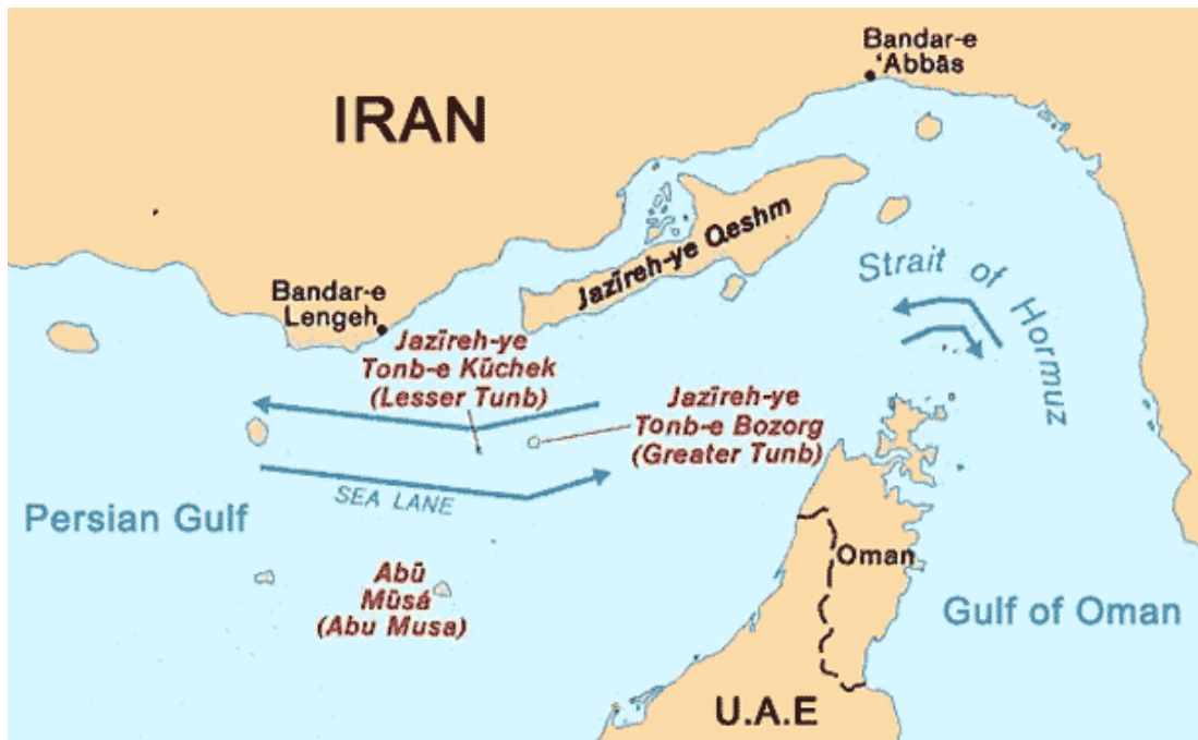
Map 1. Greater and Lesser Tunb and Abu Musa Islands