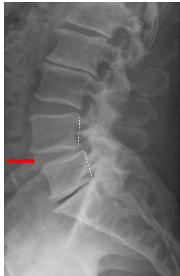
Fig. 1 Lateral standing plain radiograph noting degenerative spondylolisthesis at L4–L5

While studies have indicated that facet joint tropism may manifest as a secondary cause following degeneration of the disc, some studies suggest that tropism may be a key risk factor for disc degeneration and herniation