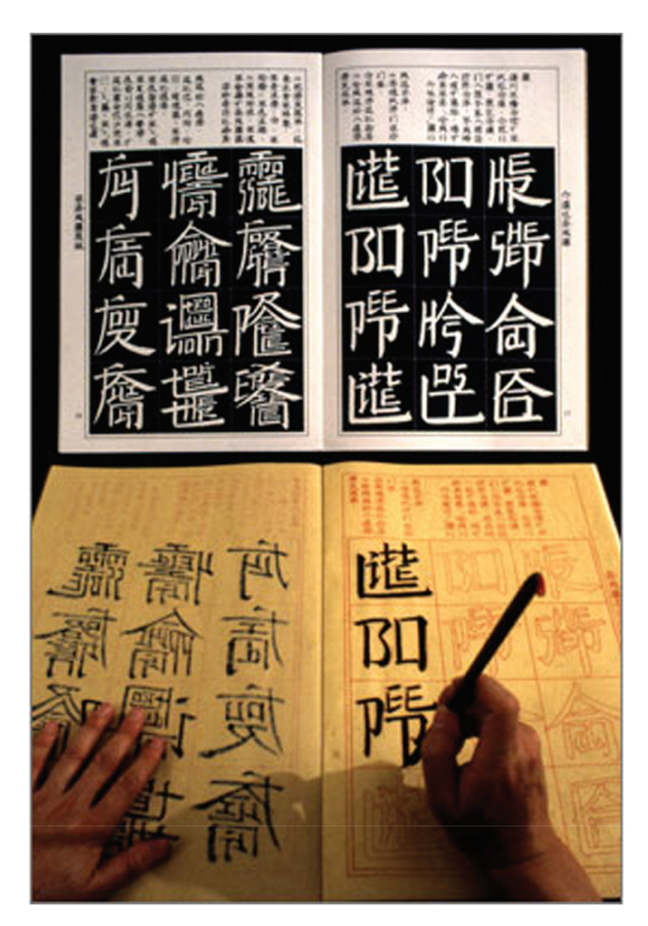
Figure 3: Instruction manual (top) and tracing book (bottom) for the classroom installation of Square Word Calligraphy .