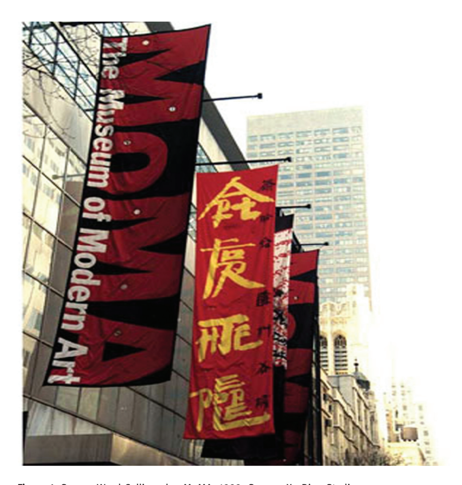
Figure 1: Square Word Calligraphy, MoMA, 1999.

characters. On closer inspection, however, these "characters" turn out to be undecipherable to the Chinese viewer: they are apparently Chinese but ultimately not recognisable as such. The greater irony is that upon scrutiny they turn out to be recognisable to the English viewer; they read, albeit in a highly defamiliarised visual: Art for the People.