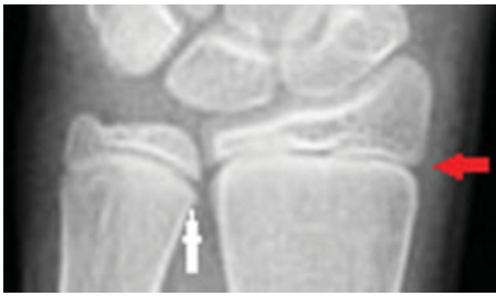
Fig. 1 Radiograph of the distal radius and ulna showing the R7 grade. Examiners should focus on the medial side capping and the absence of lateral side capping (red arrow). Note the hooklike structure/sharp outgrowth at the medial physis facing the metaphysis that deviates from the physal line. This radiograph also represents the U6 grade with the appearance of an epiphysis and metaphysis of the same width but no narrowing of the medial physal plate (white arrow).

most difficult because they were based on descriptions of multiple parameters. Each clinician might focus on something different, such as the appearance of the physis narrowing, the definition of capping, and when the epiphysis acquired the same width as the metaphysis, among others. Disagreements in the ulna grades appear larger than the radius grades, likely due to a larger range of ulna grades measured as compared with the radius.