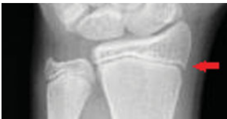
Fig. 2 Radiograph of the distal radius and ulna showing the R8 grade. Examiners should focus on the lateral side capping (red arrow). Note the hooklike structure/sharp outgrowth at the lateral physis facing the metaphysis that deviates from the physal line.

Generally, grading of U1 to U4 was not difficult due to some distinct features such as the size of the epiphysis for U3 and the appearance of the styloid for U4. The difficulties were noted for descriptions in U5 to U8. For U5 (→ Fig. 4 ), the appearance of a denser ulna head was not easily observed and so flattening of the radial half of the ulnar epiphysis was the main determinant. For U6 (→ Fig. 1 ), we found that the overlapping of the metaphysis with the epiphysis at the center third was inconsistent in most radiographs, and