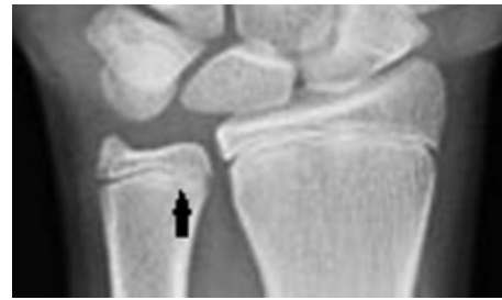
Fig. 3 Radiograph of the distal radius and ulna showing the R9 grade. Examiners should focus on the narrowing of the physis. In this radiograph, the ulna is graded U7 as there is narrowing of the medial physal plate (black arrow) but incomplete fusion.