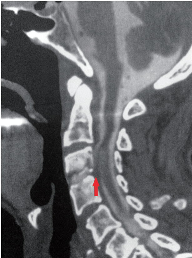
Fig. 3. Computed tomography myelogram showing C3–C4 spondylodiscitis, C3 vertebral body destruction, and the connecting cerebrospinal fluid fistula (red arrow).

The delay in establishing the link between the CNS infection and previous neck surgery and radiotherapy was the main management downfall in our case. The causative