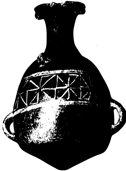
Arybal procedente del valle central de Cochabamba, Bolivia, Museo Arqueológico de la Universidad Mayor de San Simón, Cochabamba.