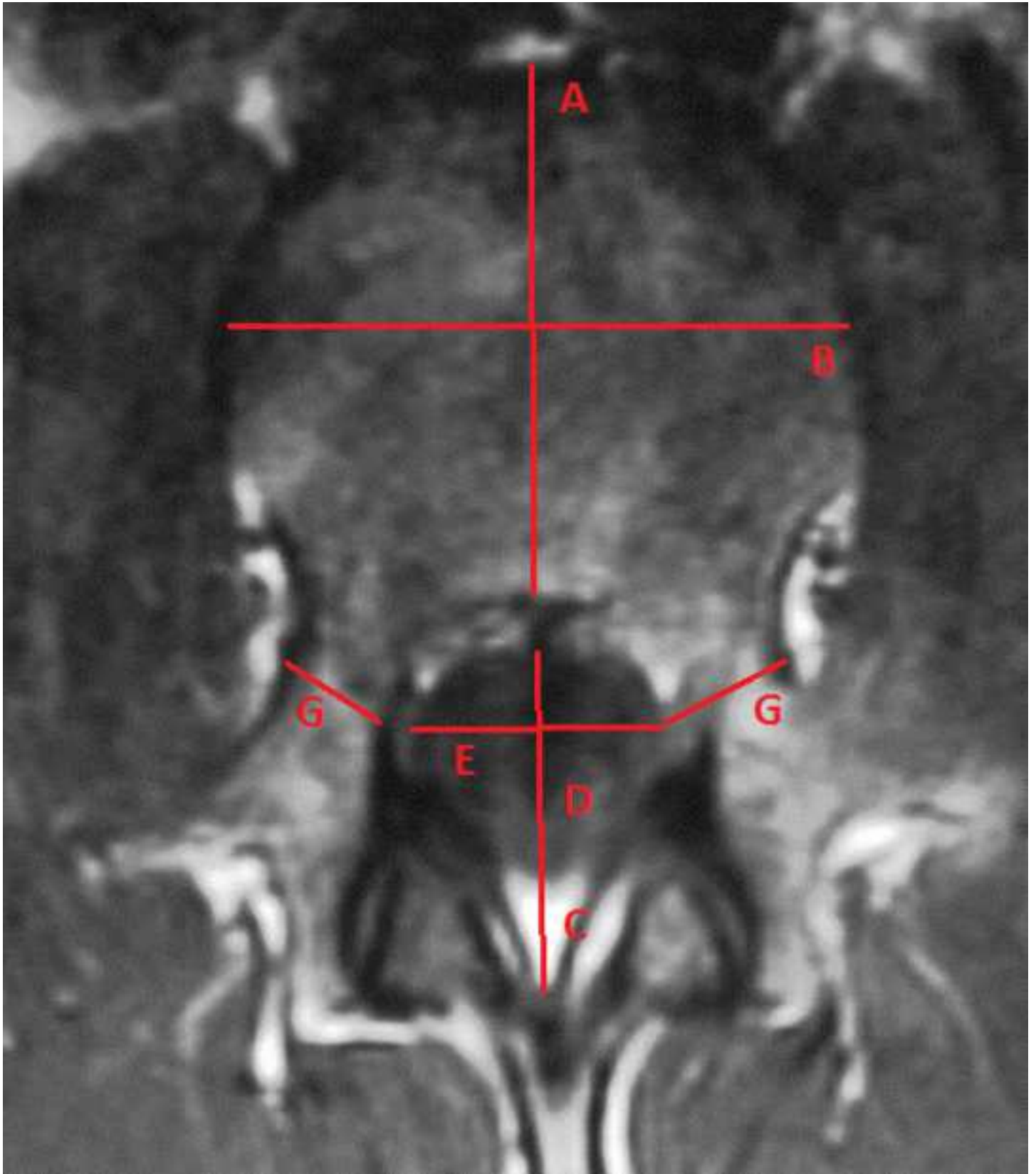
Figure 2 Click here to download high resolution image