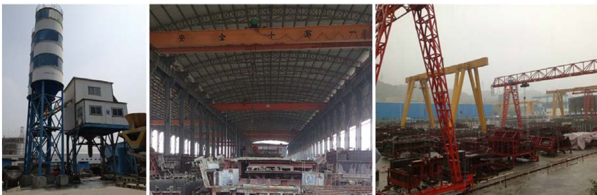
Fig. 3 Manufacturing process in prefabrication construction