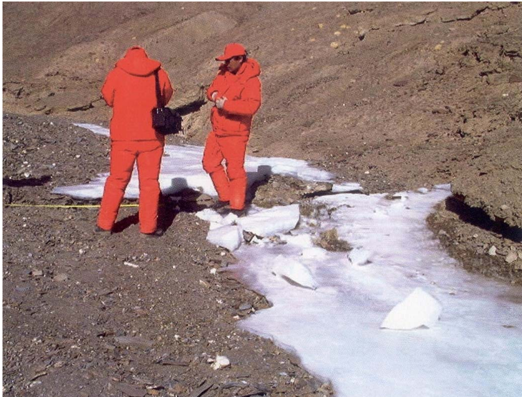
Figure 4. The ice in a gully was displaced 1.4 m in left-lateral sense 25 km east of Kusai Lake (after photograph 58 of [17])

From the site photograph 58 in Figure 4, it can be evidently observed that the frozen soil layer and the ice cover in a gully were largely uplifted, bended and then dislocated in tension and shear. The broken ice plates had fresh, sharp and angular sides and edges. There were no signs of melting, thawing, plastic flow, muds, and/or refreezing in the gully ice plates and frozen soils. In other words, the seriously broken frozen soils and ice plates maintained their frozen states during and a few days after the ground rupture and shock.