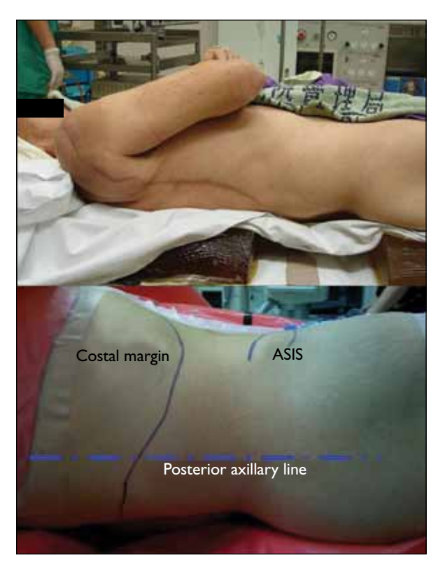
FIG 1. Patient positioning and outline of anatomical landmarks ASIS denotes anterior superior iliac spine